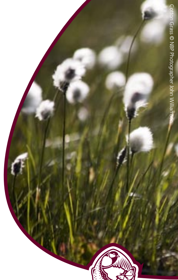
Cotton Grass