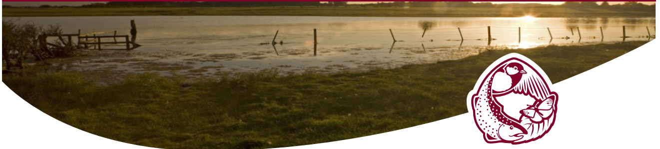
Northumberland Pond