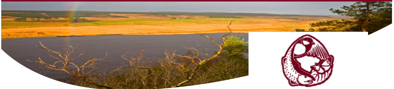
Greenlee Lough