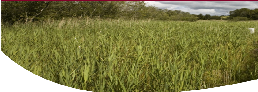
Newham Fen