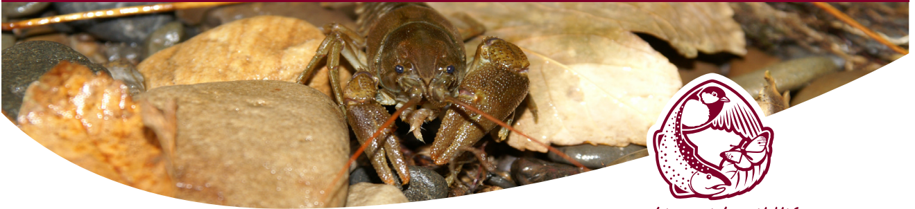
White-clawed Crayfish